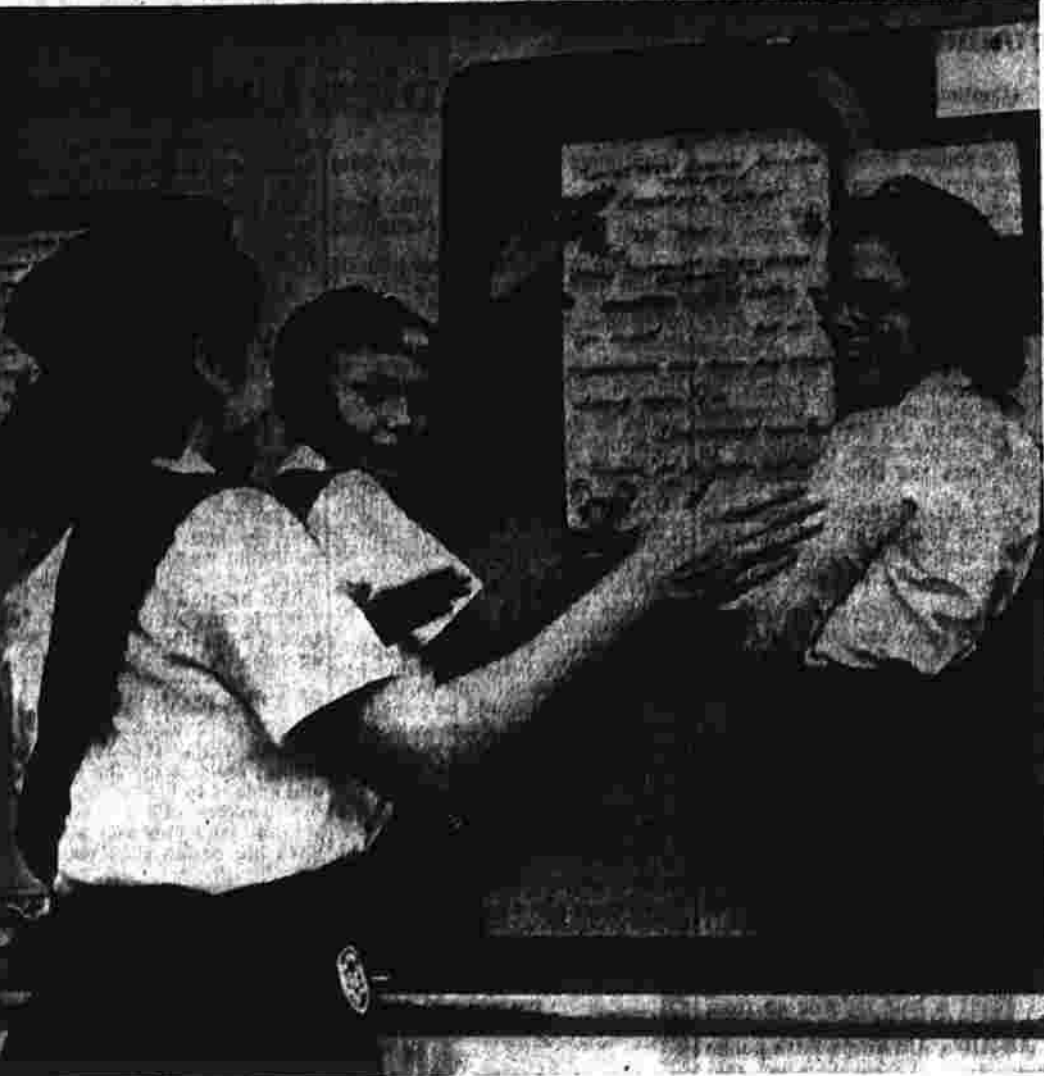
It's Even Right There, Girls